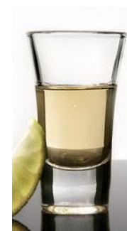
1½ oz. (40%) liquor