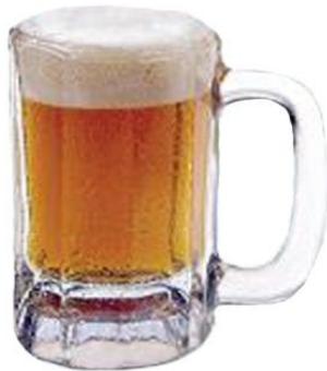
12 oz. (5%) beer