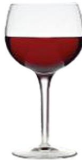
5 oz. (12%) wine